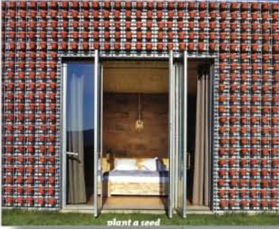
plant a seed